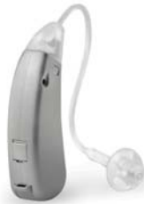
CIELO 2 Life