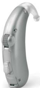
CIELO 2 P