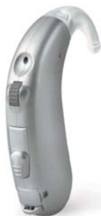
CIELO 2 SP