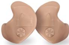
CIELO 2 ITE